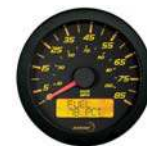
Derived from Maxima's Direct Data-Bus Instrument (DDBI™) tachometer/speedometer